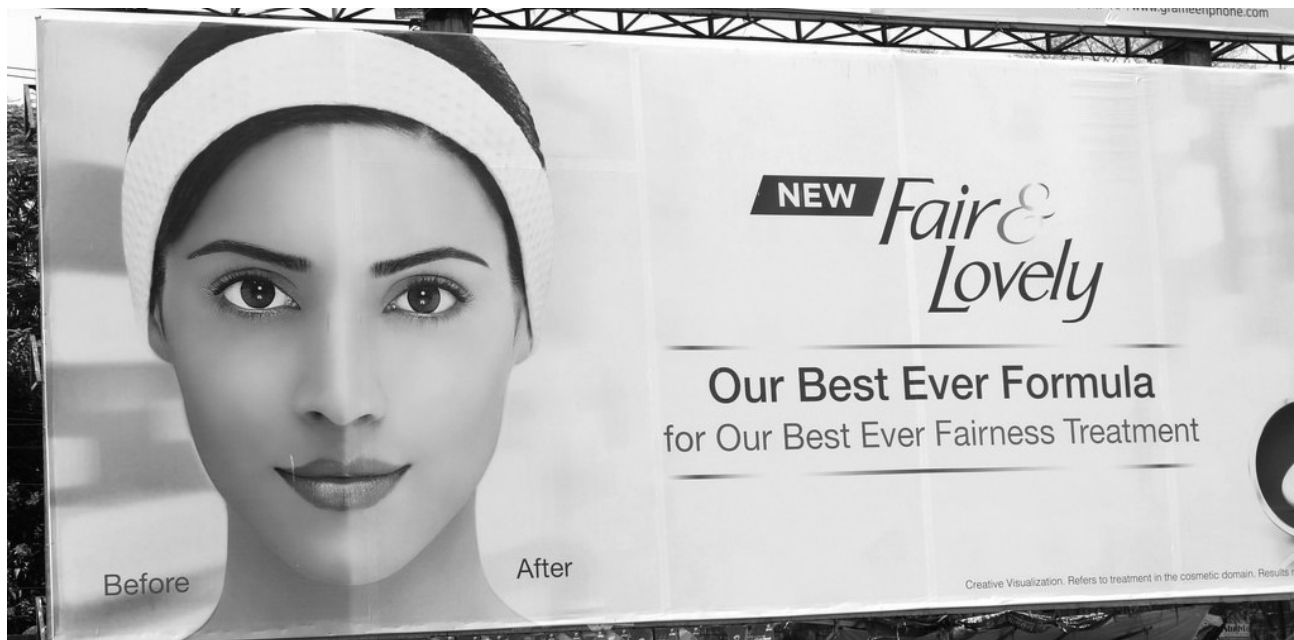
An advertisement for Fair and Lovely, a popular skin whitening brand.

conditions. People do not want to be associated with darker skinned people (i.e. poor people) because of discrimination and less availability of opportunities.