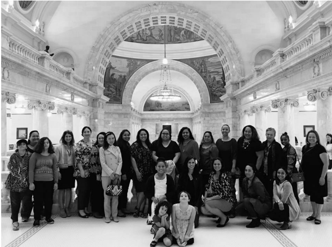
Teuila women tour the Utah State Capitol building.

LAVINIA CLARA TAUMOEPEAU—LATU | OCA - Utah