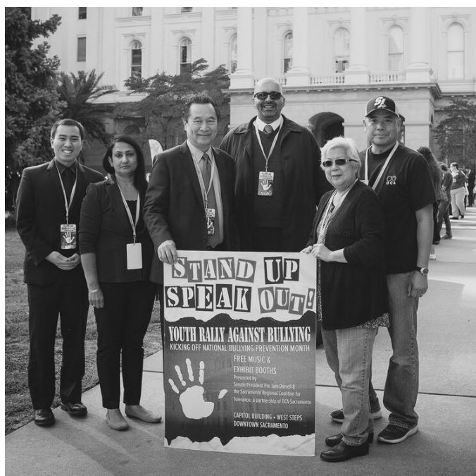
OCA - Sacramento and OCA National Center staff at the event.

The National Bullying Month at the Capitol was launched four years ago by the Sacramento Regional Coalitional for Tolerance, a program co-founded by OCA Sacramento in partnership with then California Senate President Pro Tempore Darrell Steinberg of Sacramento, soon to be sworn