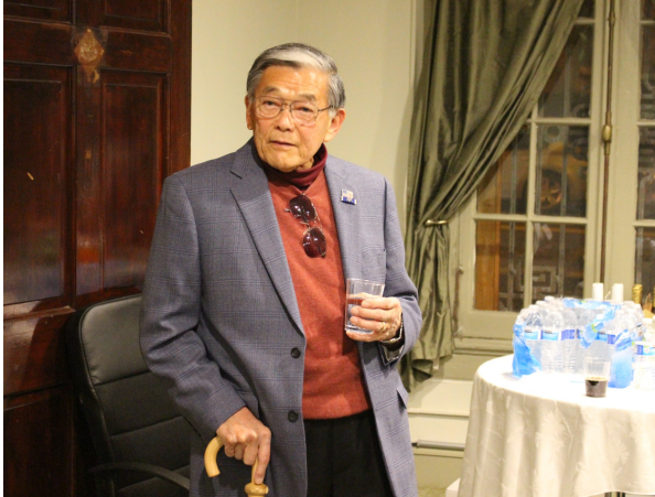
Former Secretary of Transportation Norm Mineta addresses the 2015 Leadership Summit

The annual JACL/OCA Leadership Summit brings together OCA members from across the country to build their local capacity for advocacy work, develop their community leadership skills, teach them about current civil rights issues, how to engage with elected and government officials, and how to deepen their commitment towards achieving equity and equality for AAPI communities.