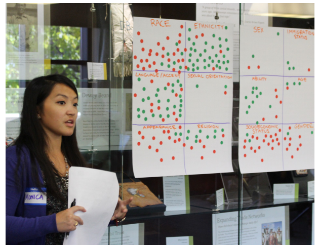
A 2015 APIA U Session in Wisconsin

Knowing that cultural influences impact how one leads, our mission is to provide Asian American and Pacific Islander student leaders and activists with a unique training opportunity that keeps in mind the viewpoints and experiences of AAPIs and other students of color.