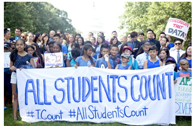
Students protest for data disaggregation on Capitol Hill

OCA also remains committed to ensuring that higher education is accessible and affordable for all AAPI students, including undocumented students. OCA's higher education platform includes a congressional mandate for all public universities to allow the enrollment of undocumented students, along with translations for the Free Application for Federal Student Aid (FAFSA) and its availability for undocumented students.