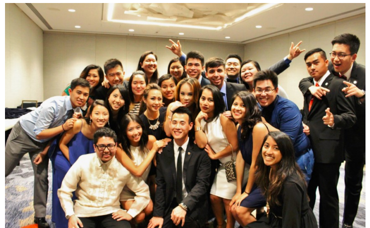
The 2015 Summer Intern Class

Interns are also given the opportunity to schedule meetings with their member of Congress for an advocacy visit. Visits entail discussions concerning public policy and an inside look at the legislative work of Congress. We encourage our interns to take this opportunity and train them on how to bring important issues to the attention of their members of Congress.