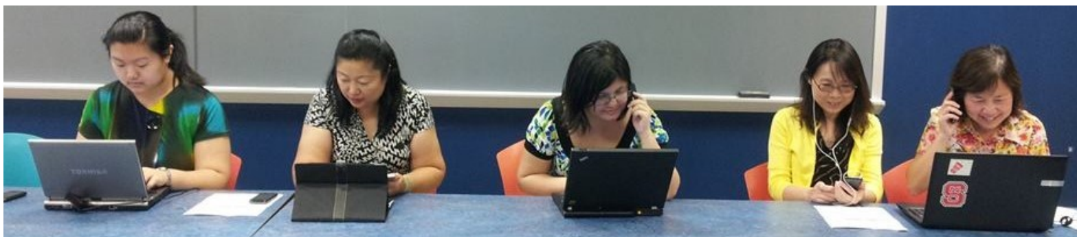
OCA– St. Louis phonebanks in advance of the 2015 mid-term elections in Missouri

OCA operates through a multi-tiered system, in order to engage all our Chapters in Civic Engagement efforts depending on the capacity and networks of the chapters. Each chapter receives a sub-grant based on local plans and through consultation with APIAVote. Activities range from hosting a public event to promote civic engagement, to hosting phonebanks to encourage AAPIs to get to the polls. OCA National helps coordinate chapter efforts by providing education and trainings around Civic Engagement. By doing so, our Chapters are able to fully mobilize their members and community to get to the polls and voice their vote.