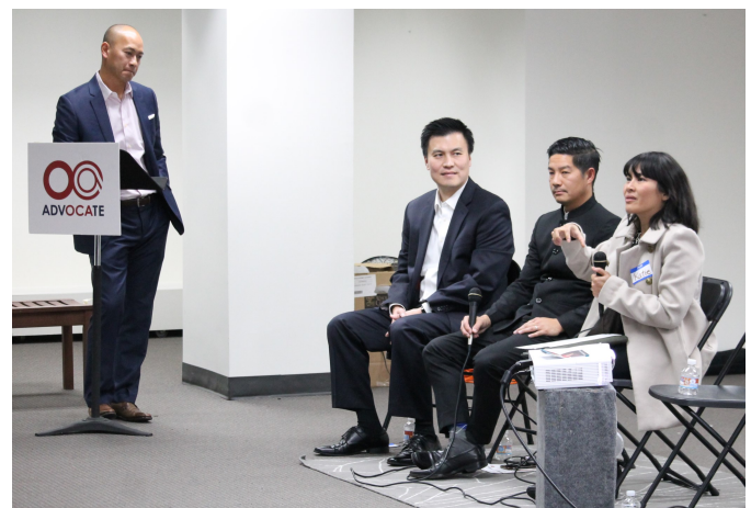
A panelist of entrepreneurs at the Orange County B 3 Program

All of this is achieved in a one-day program consisting of workshops, panels and/or seminars that are centered on professional development themes. Discussion topics can range from personal branding to corporate success tactics and strategies.