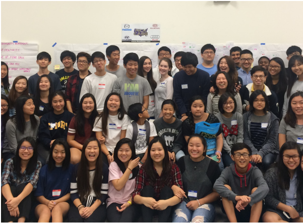
APA-Y Advocate in Long Island, NY

Launched in 2012, APA Youth Advocate is a State Farm® funded, half-day interactive training focused on equipping our youth with skills to enhance their personal development, as well as providing them a stronger platform before going to college. OCA internship alumni facilitate this advocacy training that is hosted by local OCA chapters. The half day program focuses on the development of AAPI High School youth in our communities.