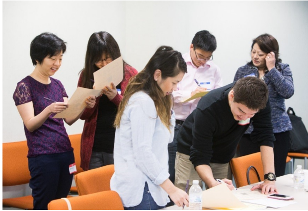
OCA - Houston MAAP participants in 2015

The MAAP program is designed to cultivate the next generation of confident, empowered, equipped, and collaborative Asian American and Pacific Islander (AAPI) professional leaders through a mutually-beneficial platform of networking and skills building. The MAAP methodology incorporates networking career planning, professional and personal skills building, and both one-on-one and group mentoring. The mentoring cohort participates in three mentoring network convenings conducted as group seminars, peer-mentoring, learning activities, and facilitated discussions.