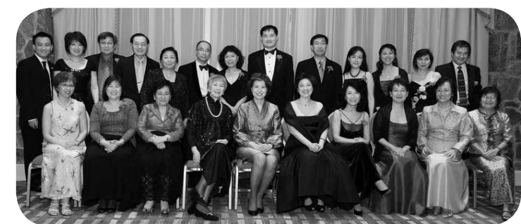
OCA-Westchester and Hudson Valley