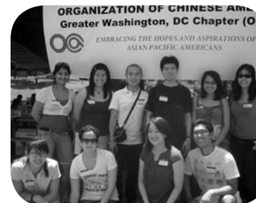
Class of 2008