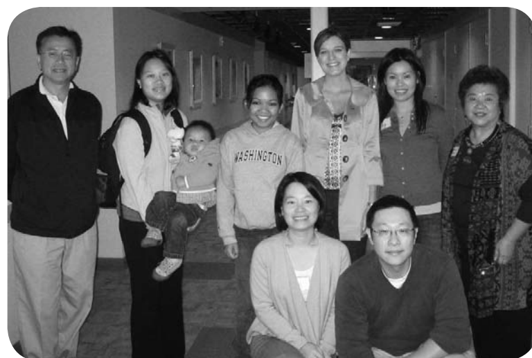
Board members from the OCA-Greater Seattle chapter

Overall, the Hate Crime Workshop was successful in engaging members of the public in discussion about hate crimes in the community, what can be done to protect ourselves, and what to do if we are a victim of hate crimes. ■