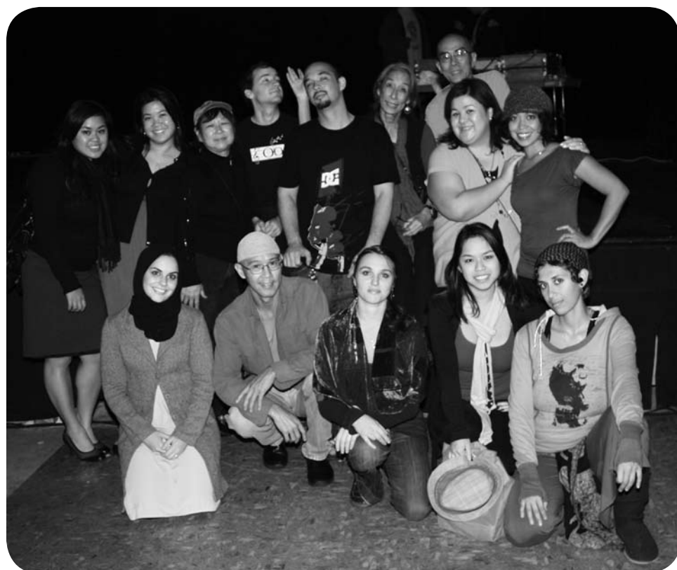
Members from Aesthetics Crew, Great Leap and OCA-GLA chapter

Seeing 1,000 students walking around campus with the Hate Crimes Initiative’s “Stop the Hate” t-shirts on along with their enthusiastic participation in the workshops, it was a testament to how important the Initiative is to the future responses to hate crimes. ■