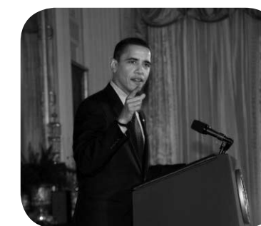
President Obama speaking at CHIP signing

On February 4, 2009, President Barak Obama signed into law the Children's Health Insurance Program Reauthorization Act of 2009 (CHIPRA) which extends and expands the State Children's Health Insurance Program (CHIP, formerly known as SCHIP). CHIP was enacted into law through bipartisan support in 1997.