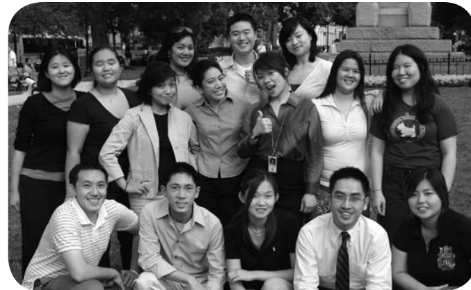
Class of 2006

The experience of the summer internship has sparked the involvement and activism in the APA community of several former interns, some of which have been profiled in IMAGE magazine over the last two years.