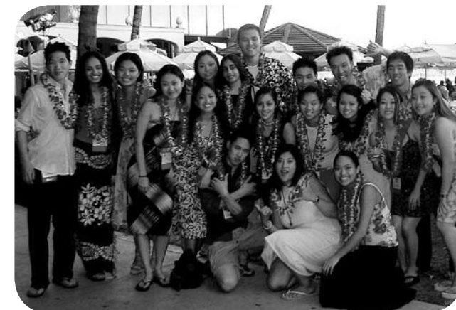
Class of 2003