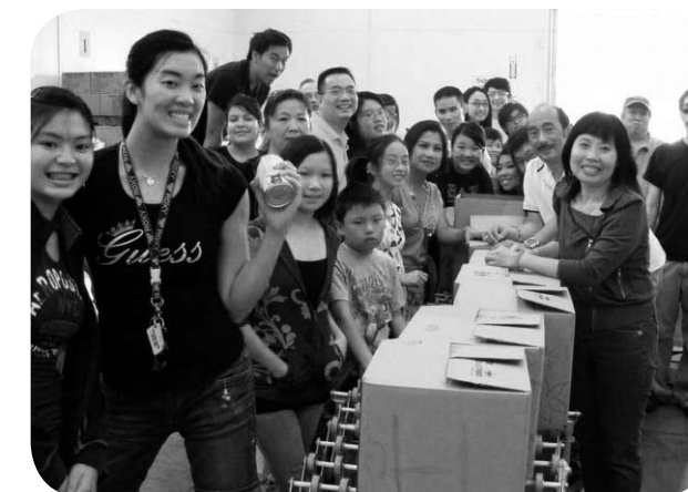
OCA-Utah, winners of the chapter participants’ drawing, stands proudly with their items. Utah won one free trip to the October Corporate Achievement Awards in Washington, DC.

OCA-Colorado chapter members volunteered hours to serve food at the Denver Rescue Mission.